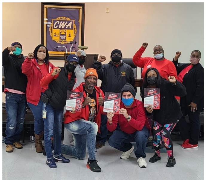
CWA Local 6215 Political Bootcamp Attendees

To prepare for the Texas Primary Elections, we hosted 2 political bootcamps, one CWA Local 6215 in Dallas, TX and one with CWA Local 6143 in San Antonio, TX for a total of 19 members. Participants learned about the 50-year class war that corporations are behind to weaken the power of the working class, and how CWA is fighting back by organizing together. They put their skills to use by visiting worksites with organizers, talking with members about the upcoming election and how to join our political action program by contributing to PAF. If you're interested in joining PAF, go to cwa-union.org/cwa-political-action-fund .