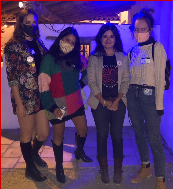
Members of LAIAC's Organizing Committee

They were visibly pro-union, built support in the community, and collected authorization cards from 15 out of the 16 employees in the unit. In the end the union won a unit that includes all the disputed positions making their workplace that much more CWA strong!