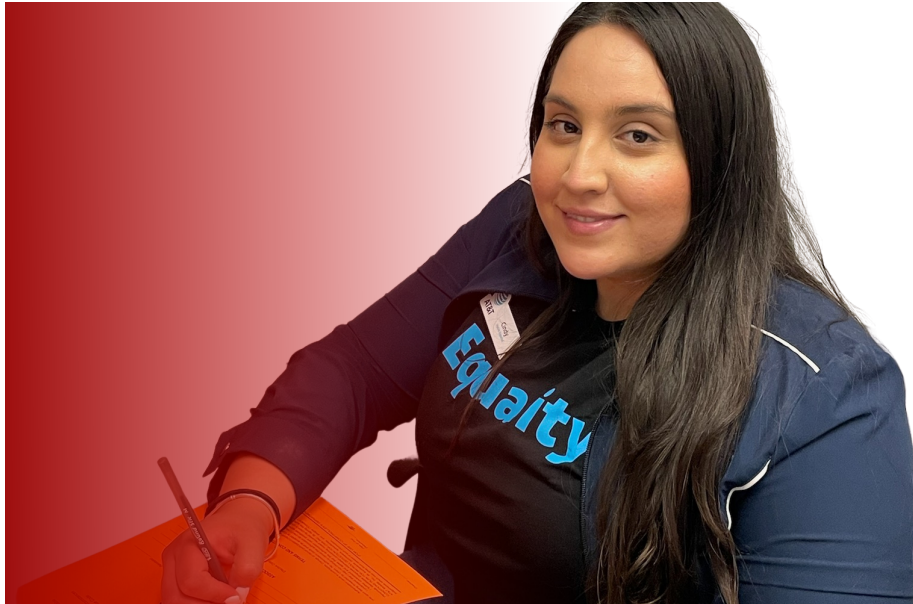
New AT&T Mobility Member Signing a Union Membership Card

Legislative, Political, & Organizing Newsletter