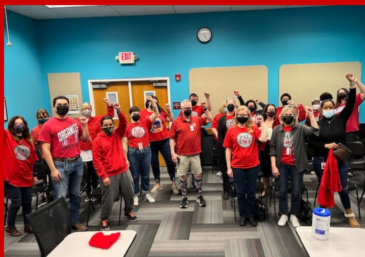
PAL-CWA Bargaining Committee

PAL-CWA is the recently organized unit of classified school employees in Lawrence, KS. Since the beginning of the year, they've organized dozens of members into the union to build a stronger, united front for the start of contract negotiations. Challenging political environment in Kansas.