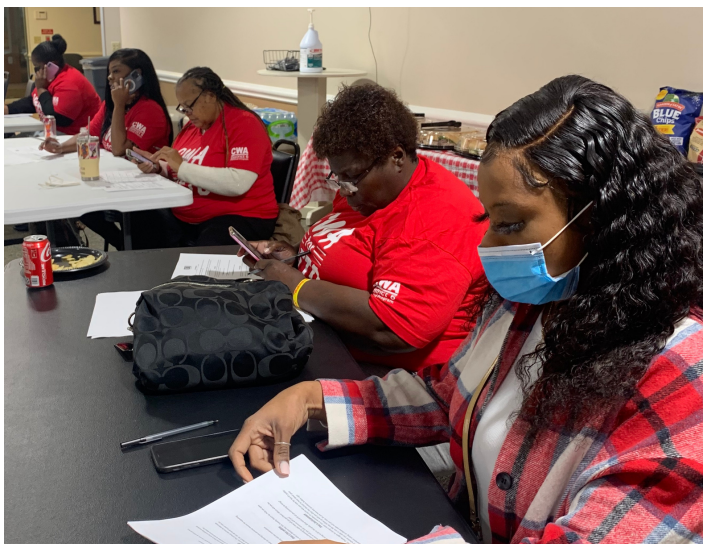
CWA Local 6222 members phone banking in Houston, TX

These victories were made possible by the work of our CWA members and independent expenditure (IE) programs. CWA members knocked it out of the park! Members volunteered for 163 shifts to phone bank and block walk to talk with fellow CWAers and the general public about our candidates. Members continued these conversations at worksites and also talked about our overall Political Action Fund (PAF) program and how to join! If you're interested in joining PAF, go to cwa-union.org/cwa-political-action-fund .