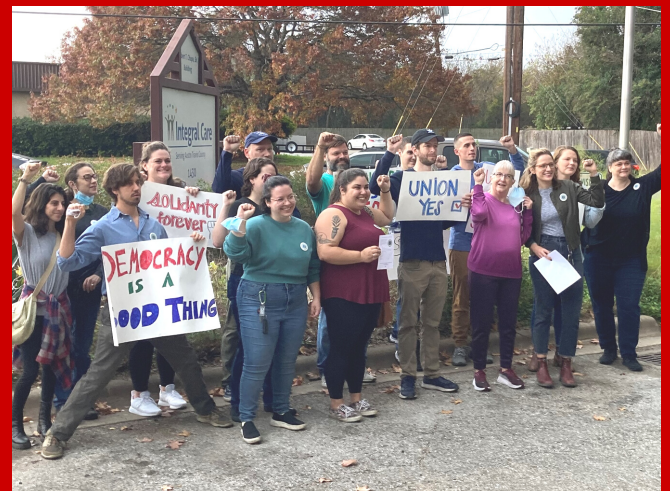
Integral Care Workers Rally in Austin, TX

Shortly after going public with their campaign, the UWIC Committee released a public letter of support signed by 17 elected officials including the mayor, city council members, county commissioners, the District Attorney, state legislators, and a congressperson. The political pressure has been a major key to the campaign's success since Integral Care is reliant on taxpayer dollars for their funding.